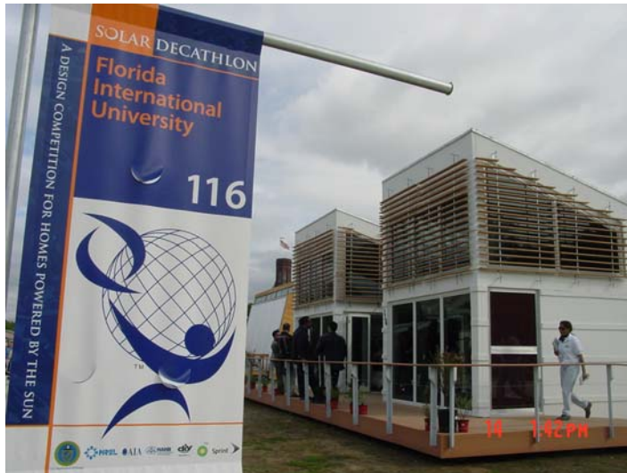
Figure 3 shows the completed FIU solar house, its transportation process to the National Mall, and its evaluation by the competition judges.

Because of the limits in available resources and initial funding, students could not freely decide upon the desired materials and products to be used; rather, they worked around the available ones donated by sponsors and their deliverability within the tight time frame. Because of this factor, students learned how to reach the compromises that were necessary to completely build the house and transport it to the competition site – the National Mall in Washington, D.C. Students and faculty faced many challenges and eventually successfully completed the construction and entered the 2005 Solar Decathlon competition.